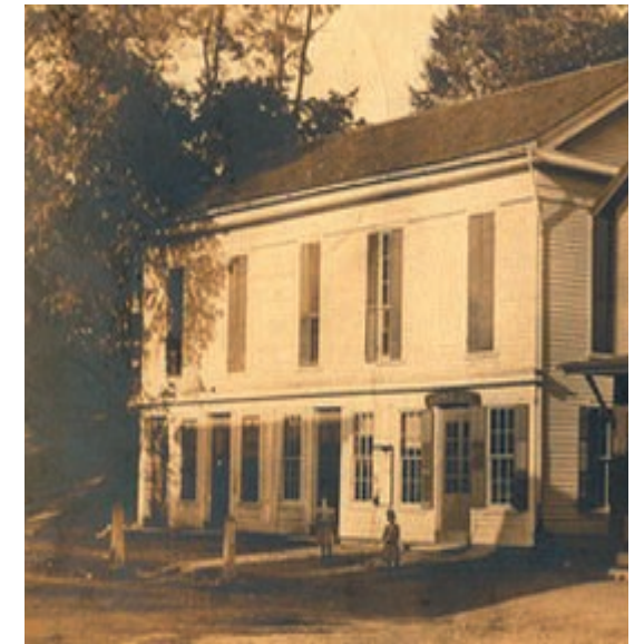
Old Town Hall

Town of West Stockbridge West Stockbridge Historical Commission West Stockbridge, MA